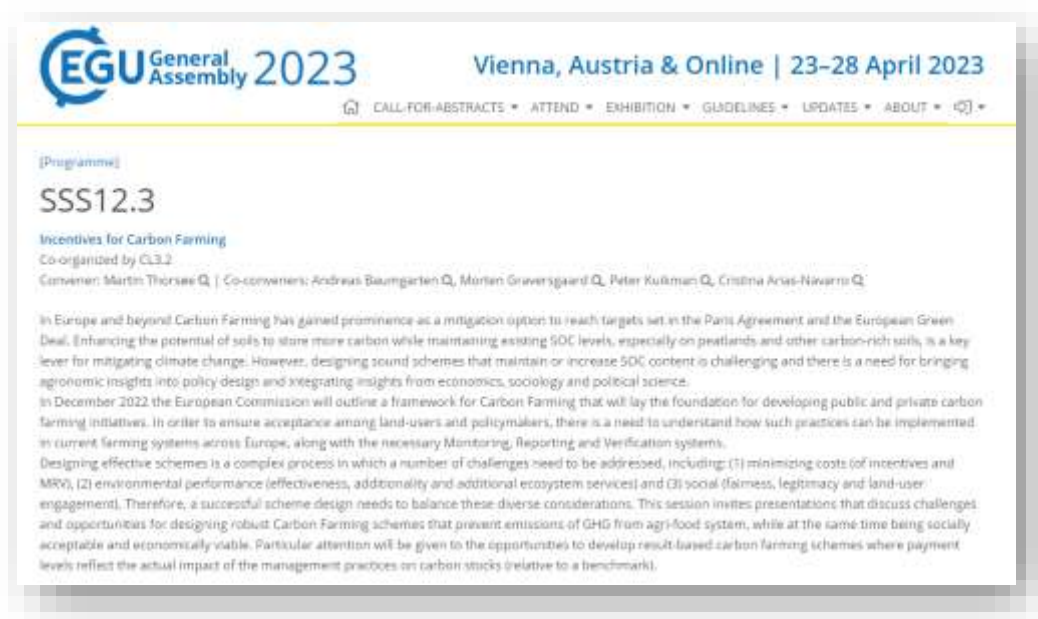
Figure 3 Description of the session on incentives for carbon farming.