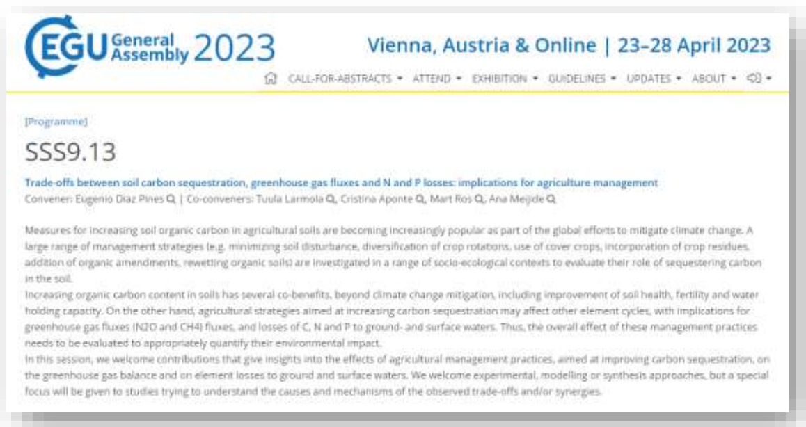
Figure 1 Description of the session on trade-offs between soil carbon sequestration, GHG fluxes and N and P losses: implications for agriculture management

A range of projects from within WP3 of the EJP SOIL Programme have applied to convene sessions at the European Geosciences Union General Assembly in April 2023. This represents the leveraging of the relationship between the EJP SOIL and the EGU to disseminate the scientific findings of the projects to a wider EU audience and promote the work of the EJP SOIL Programme. Currently there are three sessions to be convened by EJP SOIL internal project members which align with the focus areas identified for synergies in this report and the expected impacts of the EJP SOIL.