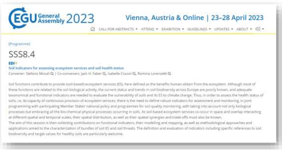
Figure 2 Description of the session on soil indicators for assessing ecosystem services and soil health status.